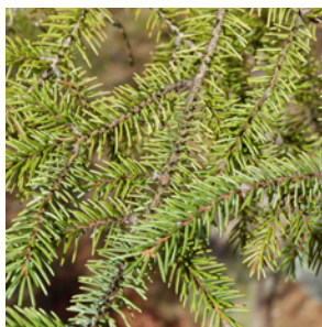
Picea mariana Black Spruce