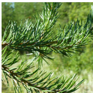
Pinus banksiana Jack Pine