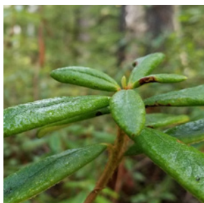
Rhododendron groenlandicum Labrador Tea