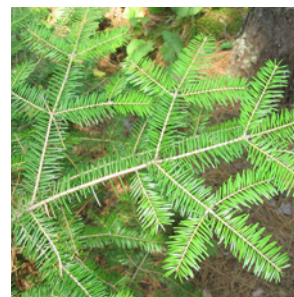
Abies balsamea Balsam Fir