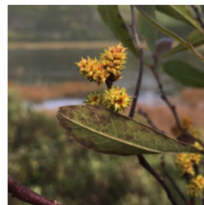
Myrica gale Sweet Gale